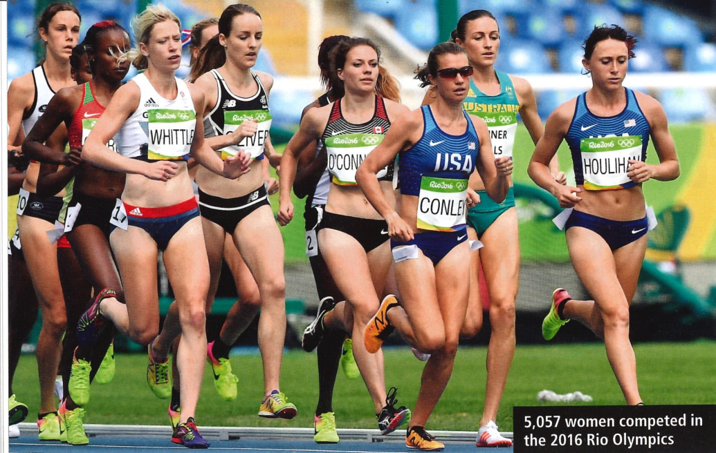
5,057 women competed in the 2016 Rio Olympics

exercise could do harm to women and their ability to bear children.